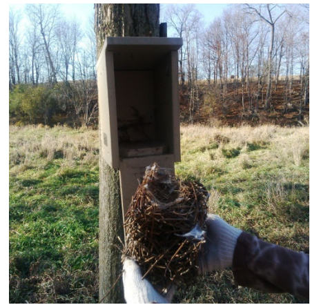
Cleaning out old nests from boxes