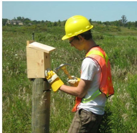
Repairing bird houses